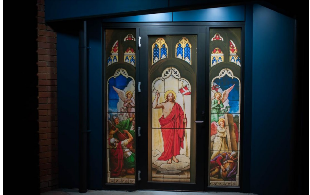
Above: Chapel Entry—Wilson Rd