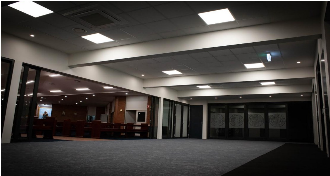
Above: Entry Foyer