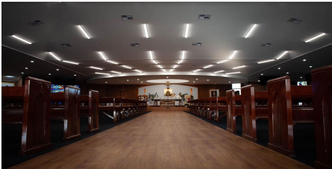
Above: Church Interior