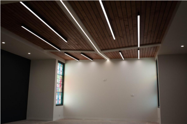
Above: Chapel Interior