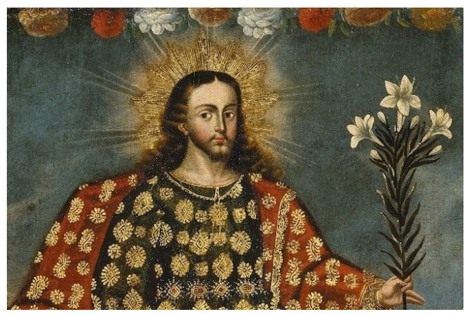
Although pure and holy, as represented by the lily he is often shown holding, St Joseph is not accorded by the Church freedom from original sin from the first

In simple terms it comes to this: Saint Joseph was born with original sin on his soul and was not cleansed from its stain until the time of his circumcision, as was the case with every other Jewish boy of his time.